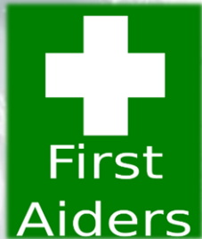
10 Paediatric First Aiders