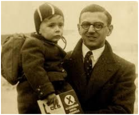
Sir Nicholas Winton