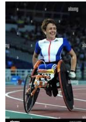
Tanni Grey Thompson