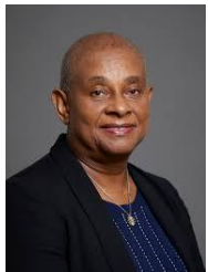
Baroness Doreen Lawrence